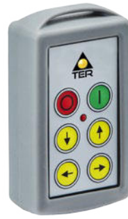
4 functions 61 x 104.5 x 9 mm