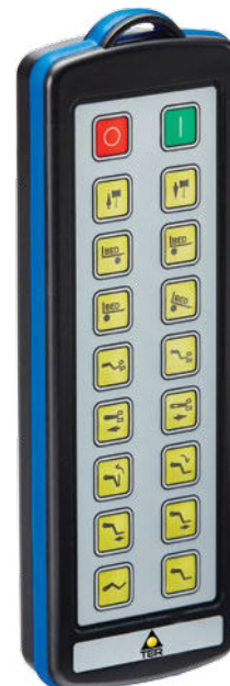
12 - 16 functions 82 x 245 x 35.6 mm