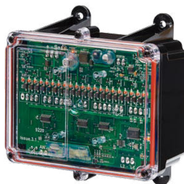
Deep 15-amp FET's 149.9 x 119.4 x 70 mm