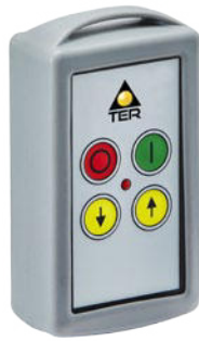
2 functions 61 x 104.5 x 9 mm