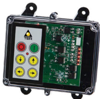
Keypad 149.9 x 119.4 x 50.8 mm