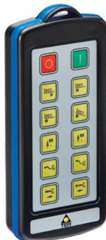
8 - 10 functions 82 x 185 x 35.6 mm