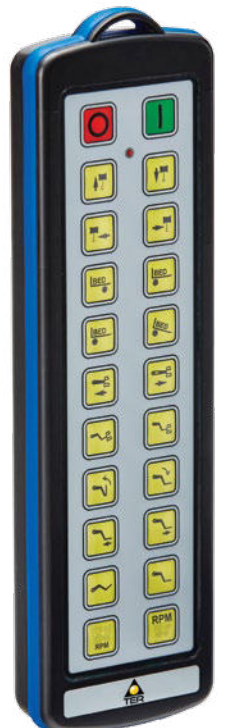
18 - 20 functions 82 x 285 x 35.6 mm