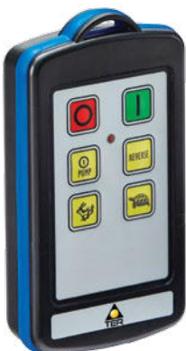
2 - 4 functions 82 x 150 x 35.6 mm