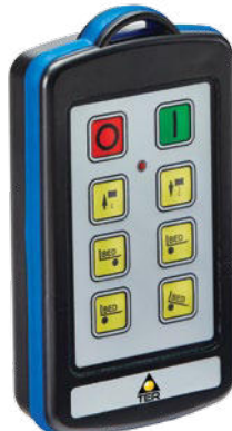
6 functions 82 x 150 x 35.6 mm