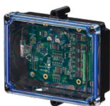
Mini RX 119.4 x 89 x 40.6 mm