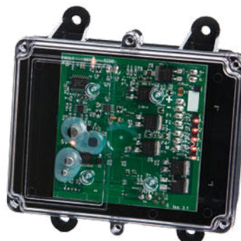
Standard 15-amp FET's 149.9 x 119.4 x 50.8 mm