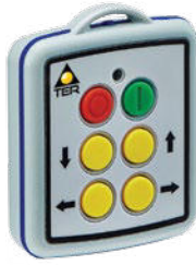
4 functions 63.4 x 72.4 x 25.5 mm