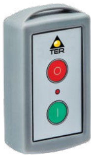
1 function 61 x 104.5 x 9 mm