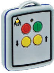
2 functions 63.4 x 72.4 x 25.5 mm