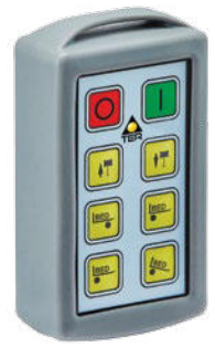
6 functions 61 x 104.5 x 9 mm